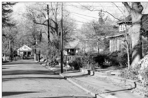
Guidelines provide a framework for residents to reference and follow when altering a property in the historic district.

It is also important to recognize that, in each case, a unique combination of design variables is at play and, as a result, the degree to which each relevant guideline must be met may vary. For example, in the case of a new building, if the proposed structure will be built of brick that is quite similar in color and scale to that used traditionally, and if it aligns with other houses on the block and is of similar height, then perhaps greater variation in the details of the new houses's design may