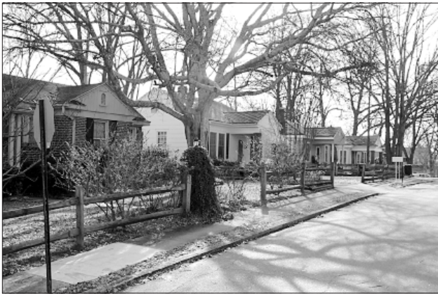
These guidelines reflect basic approaches to design that will help build strong neighborhoods.

Also, while ordinary repair and maintenance are encouraged, seemingly minor alterations to a historic resource, like enclosing a porch or changing windows, can have a dramatic effect on the visual character of a historic resource and therefore are of concern. The following is a list of common changes that can have a significant impact on a historic resource: