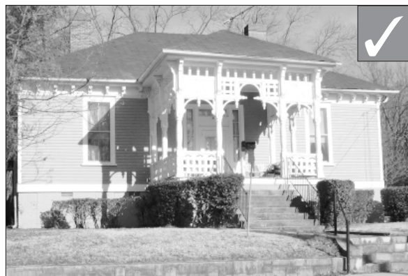
Protect and maintain significant stylistic features.