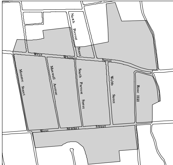
WESTSIDE HISTORIC DISTRICT

The City of Anderson Planning Department (864) 231-2222